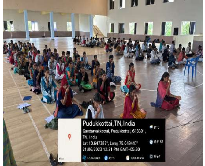
The students, while doing the practice.